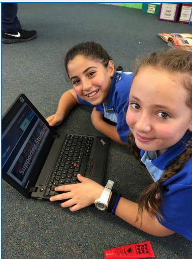
5 Bolt use technology every day in their learning