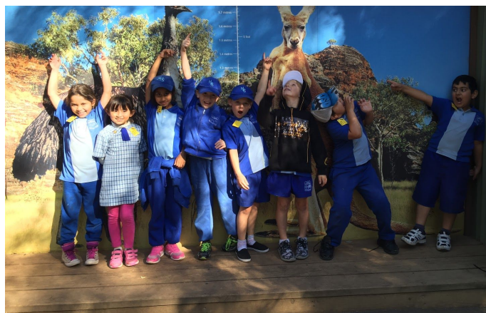
K-2 students at the Featherdale Wildlife Park excursion