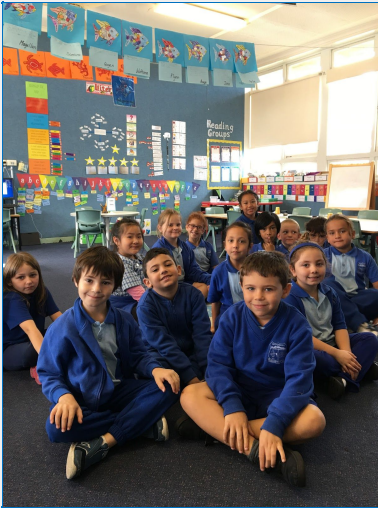
Ready for learning in 1 Sapphires