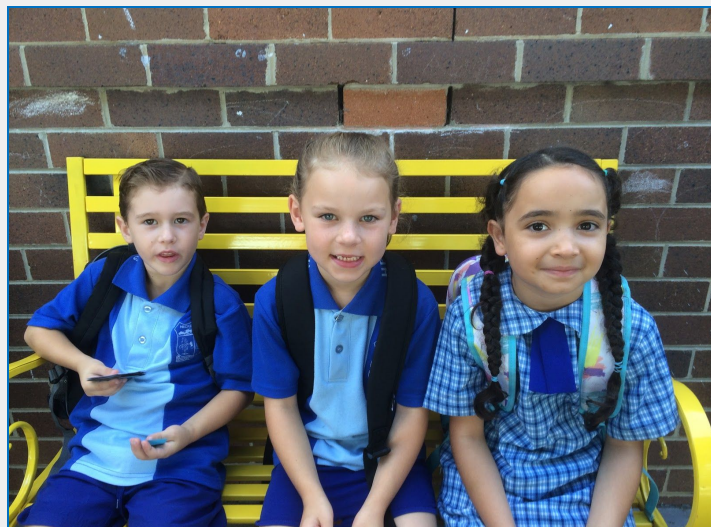
Students love sitting on our friendship benches