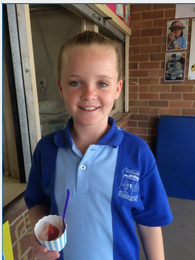
Healthy lunch mini extras from the canteen