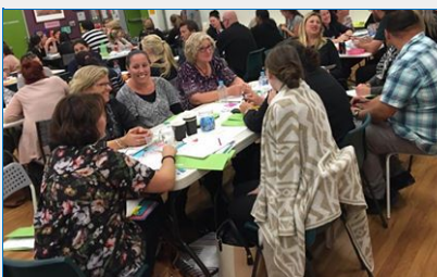
Our dedicated teachers attending an evening of professional learning.